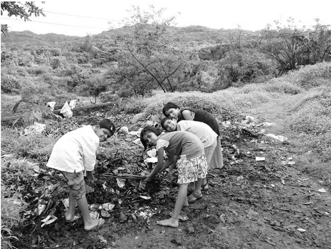
SHRAMDAAN – children are encouraged to keep the campus clean and our vast gardens used to grow seasonal vegetables.

With an over vigilante media and a government who tries to bring modern methods of child development into focus, various rules are introduced, and at times it has been difficult to adjust to them. In 2011, the government ruled