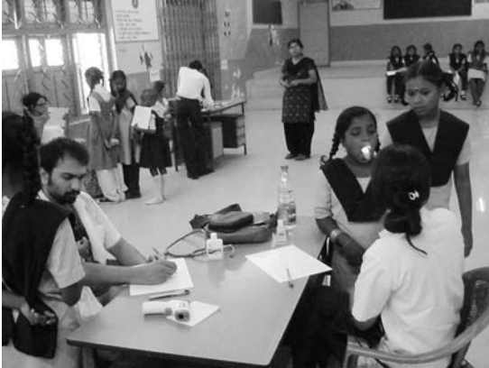
The Annual Health check-up conducted by the doctors of Somaiya Medical College, Mumbai.

Social and Health related issues of Adolescent girls: When session on social and health related issues of adolescents were conducted, the girls were shy to begin with, but later opened up. The session on different types of touch was a huge success.