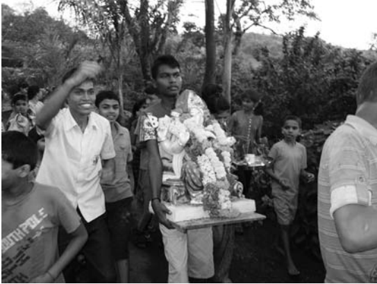
Its FESTIVAL TIME!!! Going to immerse the Ganesh idol which is installed in Balgram every year.

that all homes could either take girls or boys. Seeing our genuine care and expense incurred for the children, we have been allowed to retain children of both sexes for the time being. However, there is immense pressure to integrate them into society by the age of 18 years, which is the official limit. Thereafter all the senior children who continue to stay with us are at our total expense. We have now the additional cost of higher education as well as basic cost of living etc. to be borne for these children.