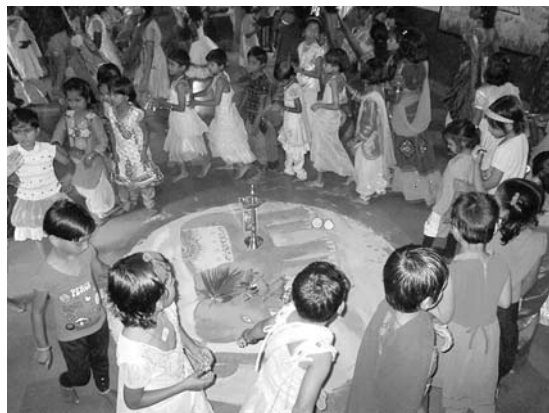
Dancing to garba beats during Navratri.