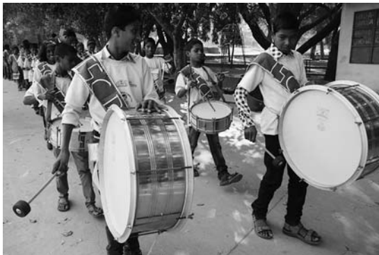
Our very own ISC Band.

ISC has cooperated with some of the schools for the implementation of the Right to Education Act and even succeeded in actively becoming part of the School management committee (SMCs) in two instances. The frequent meetings with the parents and the school authorities was effective in bringing about this acceptance from the parents.